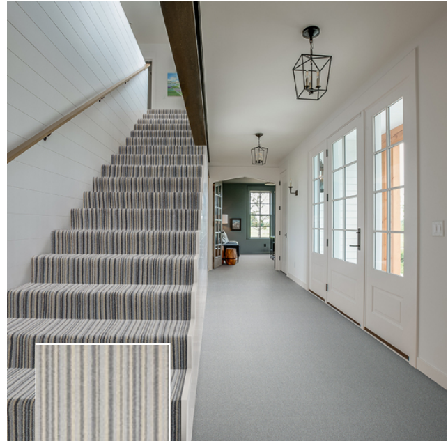
871 / Fairfield Stripe / Silver 1