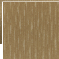
340 / Lagoon / Amber