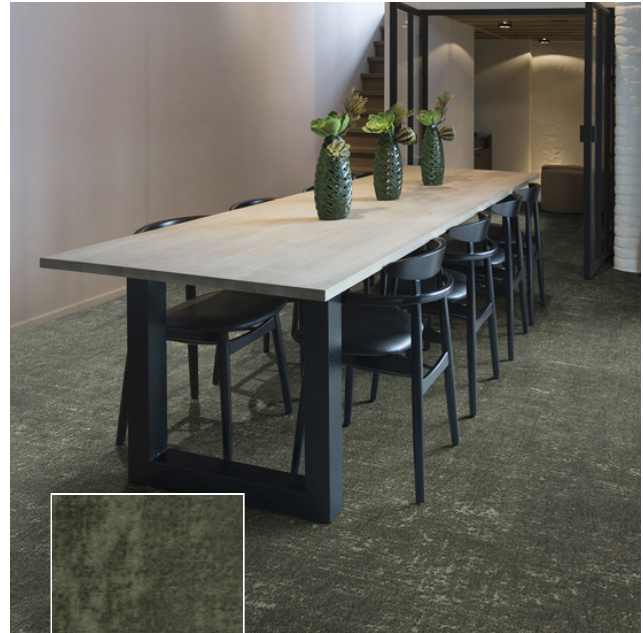
590 / Basalt Vintage / Moss