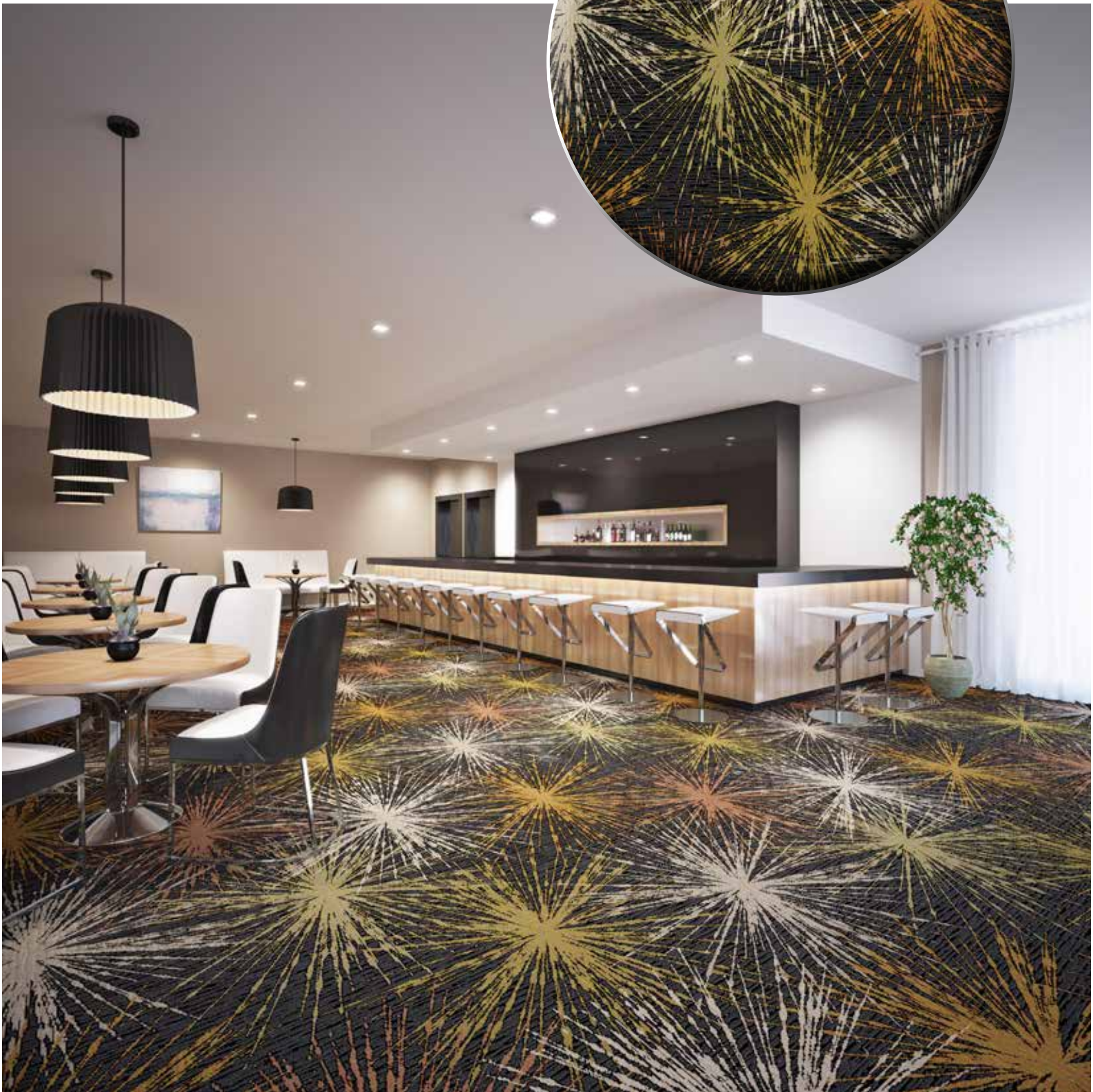
Design AD093403 - Large scale 'star-burst' effect motifs in bold colour contrast and textures.