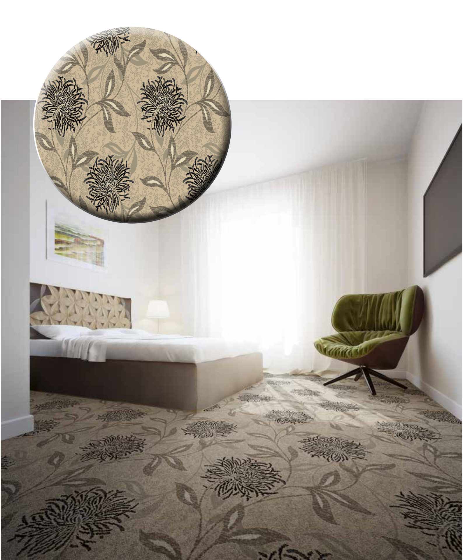
Design AD093400 – Contemporary floral pattern presented in stark colour contrast with textured background.