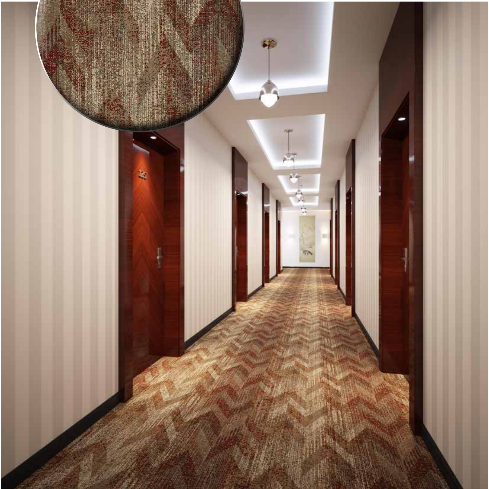
Design AD093402 – Random layout chevron pattern using a heavily distressed texture.