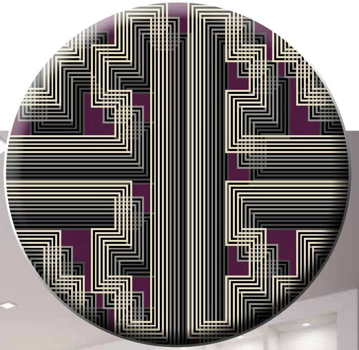
Design AD093401 – Large scale, linear geometric pattern with an interesting optical three-dimensional effect.